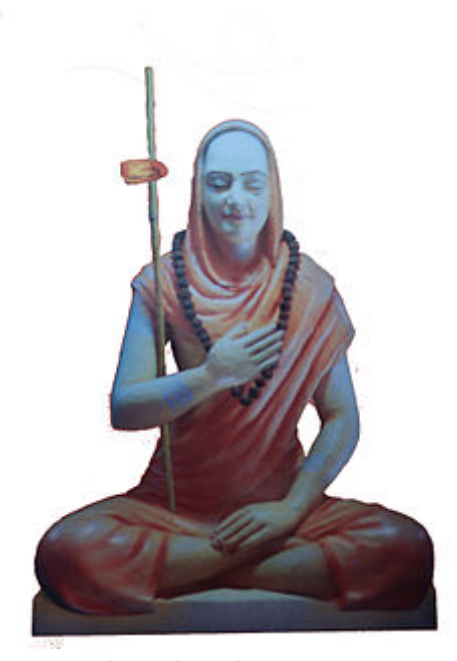
Statue of Gaudapada

Gaudapada wrote or compiled<sup>[290]</sup> the Māṇḍukya Kārikā , also known as the Gauḍapāda Kārikā or the Āgama Śāstra .<sup>[291]</sup> The Māṇḍukya Kārikā is a commentary in verse form on the Mandukya Upanishad , one of the shortest <u>Upanishads</u> consisting of just 13 prose sentences. Of the ancient literature related to Advaita Vedanta, the oldest surviving complete text is the Māṇḍukya Kārikā .<sup>[292]</sup> Many other texts with same type of teachings and which were older than Māṇḍukya Kārikā existed and this is unquestionable because other scholars and their views are cited by Gaudapada, Shankara and Anandagiri, according to Hajime Nakamura.<sup>[293]</sup> Gaudapada relied particularly on Mandukya Upanishad as well as Brihadaranyaka and Chandoqya Upanishads .<sup>[292]</sup>